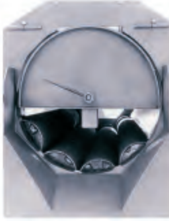
PEELER w/ GATE DISCHARGE