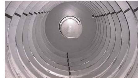
Internally Fed Wedgewire Drum